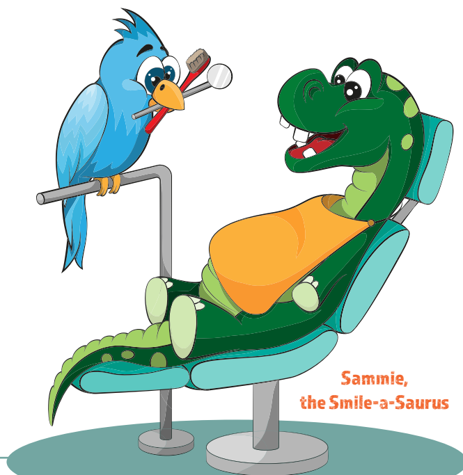
Sammie, the Smile-a-Saurus